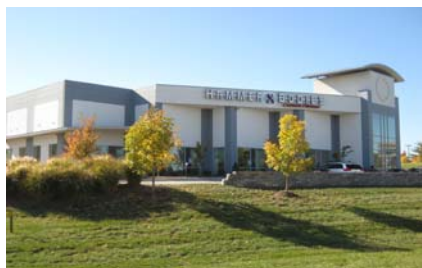
The HammerBodies Custom Fitness Clinic

Phone (800) 321-0711 or (314) 567-3797 to register! (or turn over for additional detail)